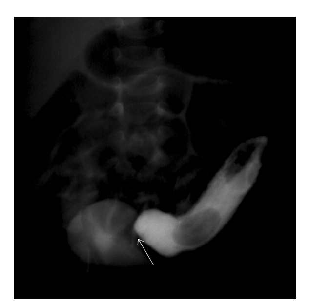
Fig. 2. Recto-vesical fistula

tract such as VUR and ureterocoele. Finally an intestino-vesical fistula was found, which can predispose to dissemination of fungal pathogens.