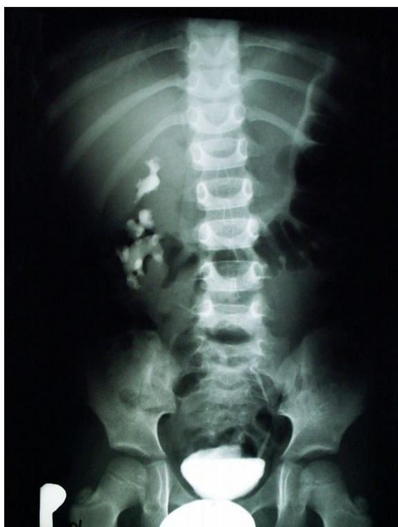
Fig. 1. Image of IVU shows both kidneys located unilaterally on the right side; ectopic left kidney, malrotated and located below the right one. Ureteral orifices are in their normal anatomic positions

a 12-year-old girl, secondary dilation of the renal pelvis of the normal kidney was caused by the crossing vessels of the ectopic one (Figure 2). Calisti et al. postulated that vascular anomalies found in C-RE may lead to dysfunction of the ectopic kidney [4], whereas Van den Bosch et al. found no significant differences in GFR, blood pressure and proteinuria between S-RE (simple renal ectopia) and C-RE individuals in childhood [12]. Additionally, there were no renal function abnormalities present in our patients.